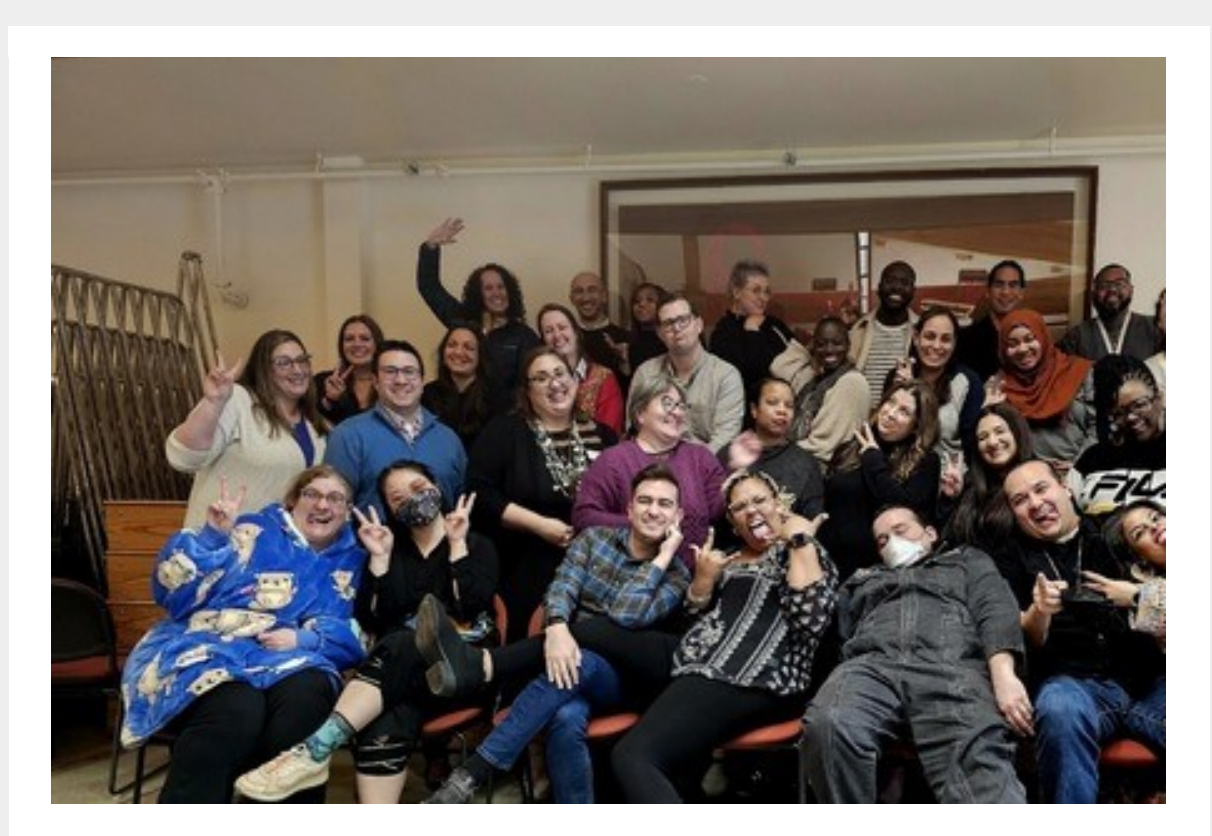
A goofy photo of the Office of Equity Staff at their staff retreat in March 2024.