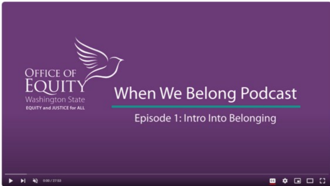
When We Belong Podcast: Intro Into Belonging | Season 1 Episode 1